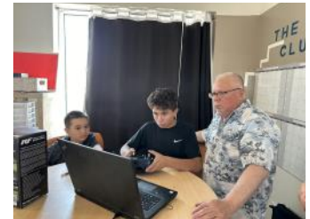
Final Day at Boys & Girls Club