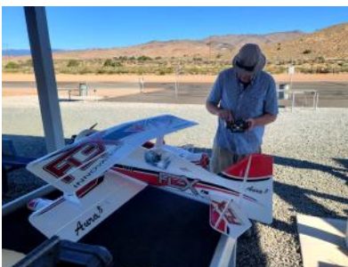
Heitkamp's 6 cell Mamba Biplane