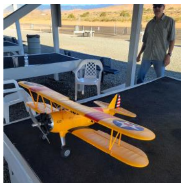
Gary's Navy N2N Biplane