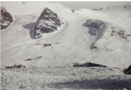
Twin Swizzle Stick over the Mendenhall Glacier (AK) in the 70's

Over the years I am sure the cost for this kit has risen as Balsa price now is $118. Not a bad price since the wing ribs are already cut and you get landing gear and the pre cut stab. I have been building "Swizzle Stiks" since way back as I have lots of wings (if you need one) and a Lowe's close by. Do we want to have another Swizzle Stik Fun Fly next year? Maybe combine it with the Aero Scout to form the SWIZZ/SCOUT DEIGN FLY IN. Something to consider.