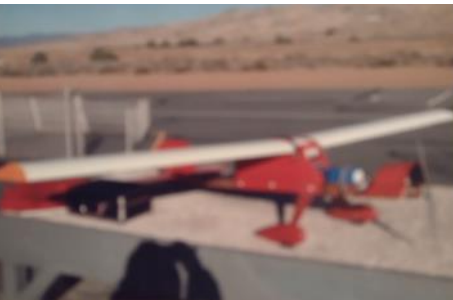
Les Harris' eight foot 35 cc Swizzle Stik