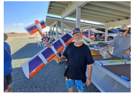
Through raffles, the Swizzle Stik will live forever.