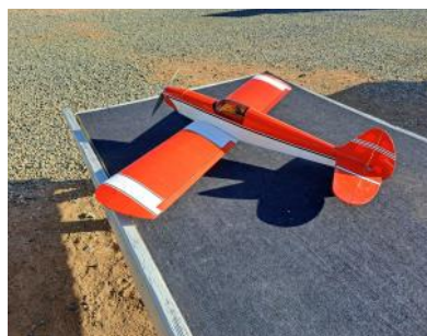
The Event Host's Sportsman.