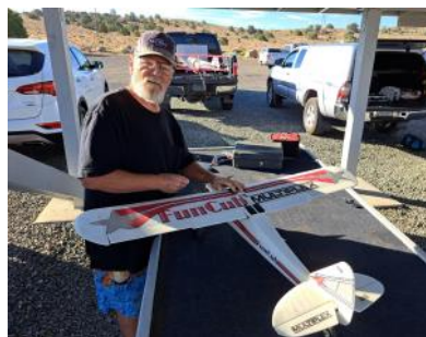
Yes it is a Fun Cub.