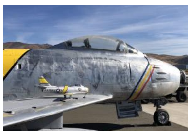
All right big boys, wanna see what these will do?