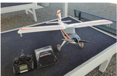
All ready to go.