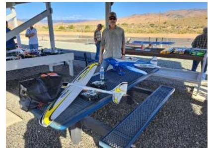
A Consendo, a Commander and a President.