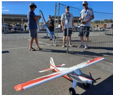
It is hard to beat a Turbo Timber from Reno for an Electric Fun Fly.