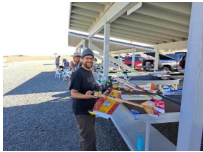
First Raffle pick was a yard-stick Mamba by our Tahoe member