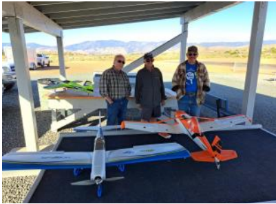
One old guy and two younger ones