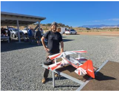
This was a representative of the electric biplanes, an Ultimate.

Did I hear a rumor for considering a Fossil Fuel Fun Fly?