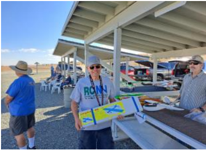
Even a Control Line kit is a raffle prize.