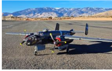
Start them up Larry