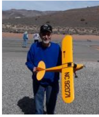
A past Sierra Sage-brush Flyer