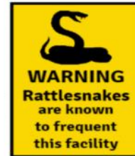
High Sierra Radio Control Club