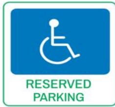
By Authority of High Sierra Radio Control Club

These four signs are what we have now ready to hang